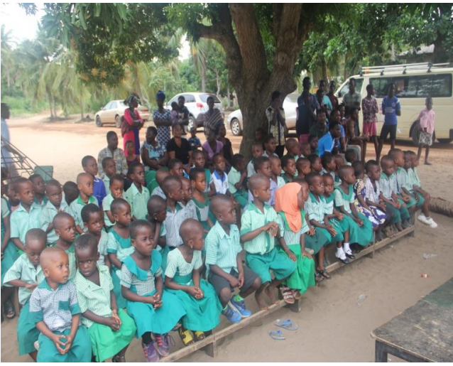
Worgbato students waiting to receive their meal