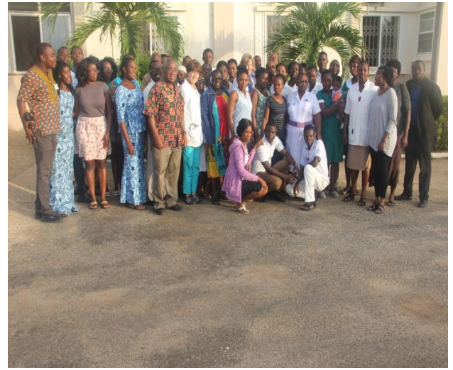
IHDN Mission Team with Hospital Staff