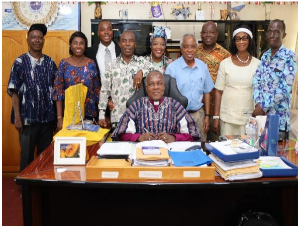
EP Church leadership hosted mission team