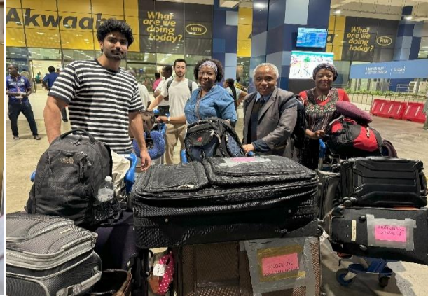
Mission team from October 2024