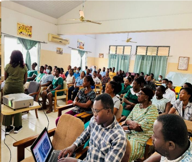
Hospital Staff at Morning Devotion