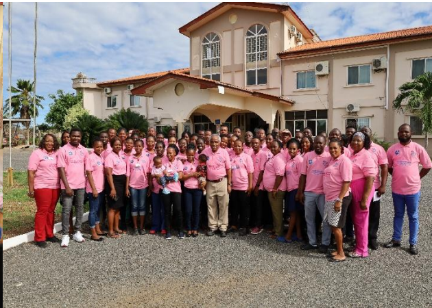
After Breast Cancer awareness durbar