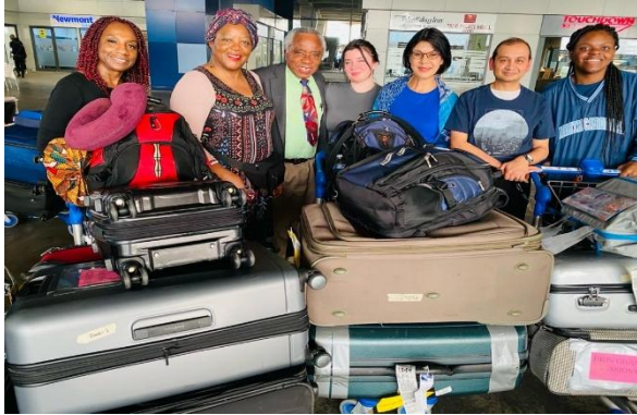
Mission team from January-February 2024