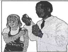
COMMUNITY HEALTH WORKER TRAINING

Tim Rice established a computer laboratory with twelve computers. There were over 150 people who signed up for